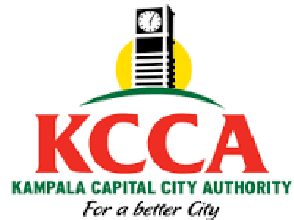
Kampala City Council Authority (KCCA)